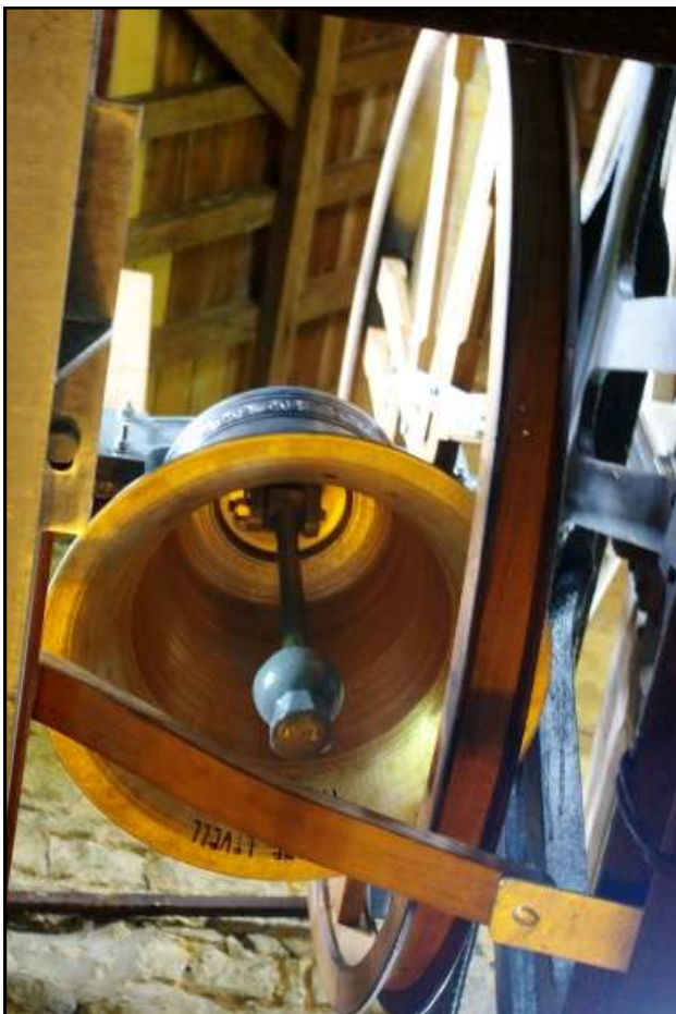
The new treble at Lillingstone Lovell