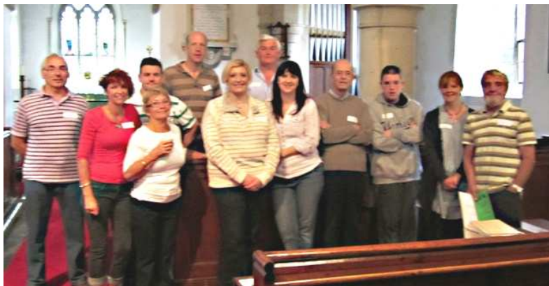
Some of the new ringers at Stoke Goldington