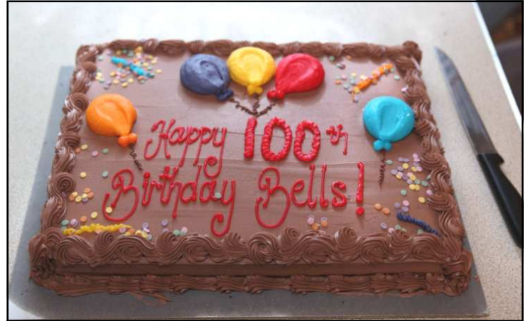
The birthday cake.