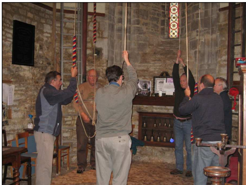
Ringers in action at Ringstead

Then it was on to Burton Latimer (8), where we enjoyed good ringing on these wonderful bells. Ringing