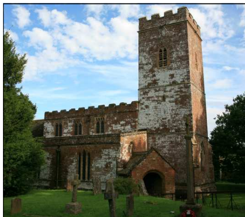
Wigginton Church, the final tower

As for those of us who took part, we each received a certificate and everyone was applauded. What a day to remember and what a lot to share with my local band. What about my excitement, fears and doubts? Well, it's obvious I have no aptitude for bellringing but I always think it's fun. I've heard a lot and learned a lot, but my eyes, ears, mind and hands don't function as smoothly as they should. Progress is slow. Wonderfully though, others still encourage me and expect me to get better. However, my determination and enthusiasm is tempered with reality. My advice to others – HAVE A GO! Thank you to everyone.