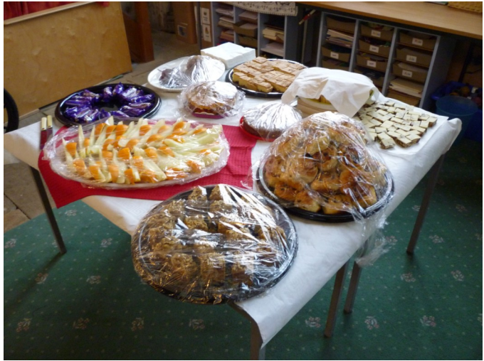
A 'proper' Ringers Tea!

The Tuesday practices have been busy as ever with the arrival of the new ringers from the Big Ring Pull. We are at Great Linford every Tuesday now, having given up the monthly visit to Downs Barn.