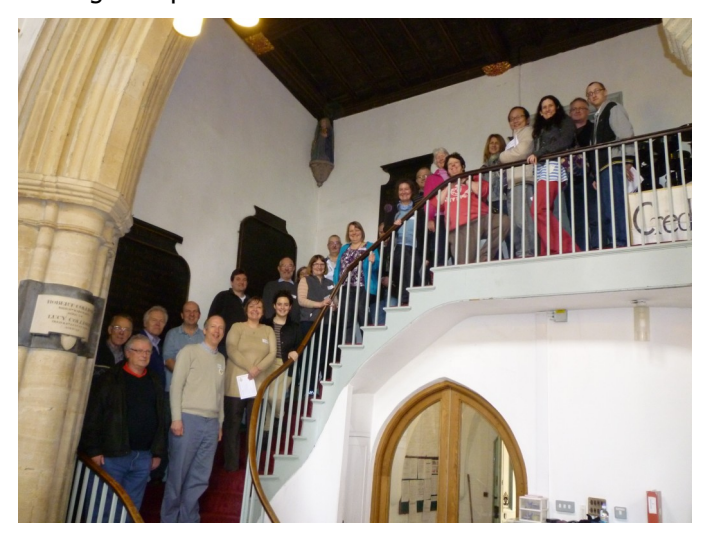
Learners and Tutors at the final training session (am group)

At the time of the update on the Big Ring Pull project in the last edition of In Touch we had just completed the recruitment day in Middleton Hall in the shopping centre. Over 80 people had registered an interest for the "have a go" day at Downs Barn two weeks later and a huge effort was being put in to collating all the names captured and following up with everyone who had signed up.