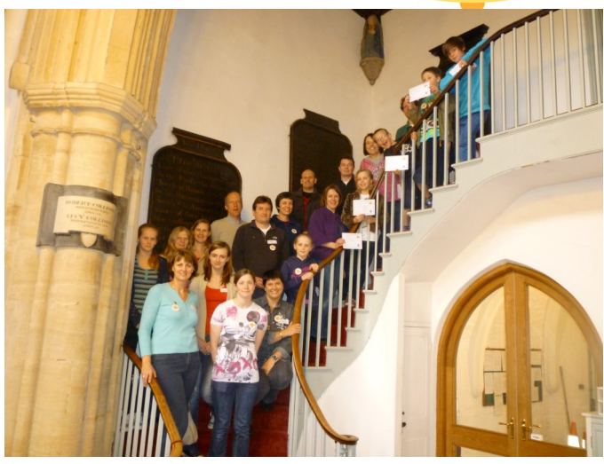
Learners and Tutors at the final training session (pm group)

The new ringers have subsequently completed an online survey about the training process and from this we have gained some very positive feedback.