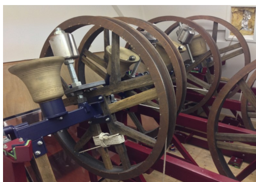
Picture of the bells