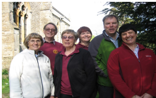
Milton Keynes Village