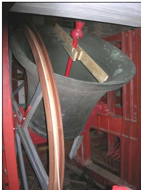
One of the new bell ties in operation at Newport

You can change the sounds so it rings like your own bells or another tower's. All Abel needs is two bell tones and it will generate all the other notes for you. I am building up a collection of bell sounds by different