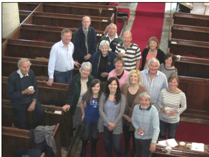
The new Stoke Goldington and Weston Underwood Ringers - and some extras