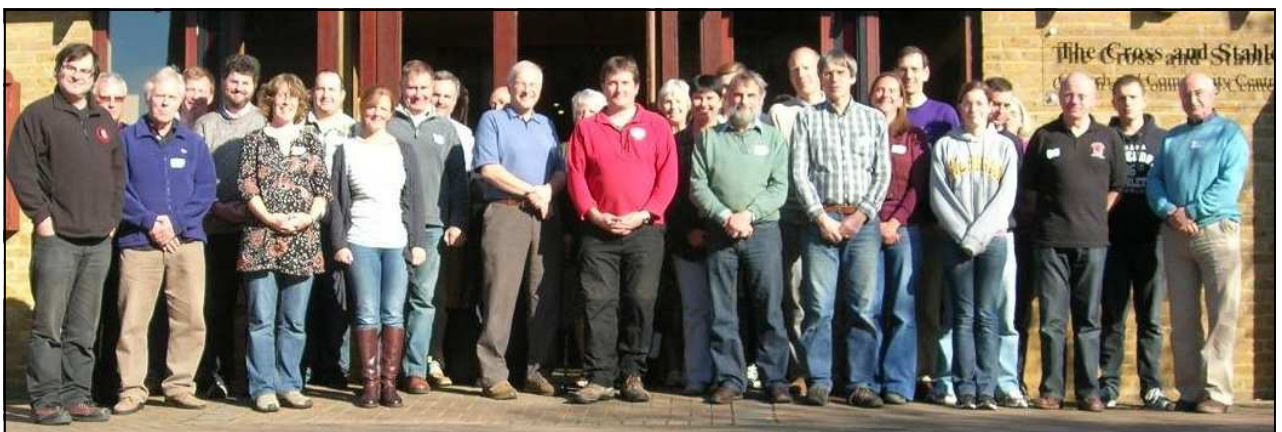
The teachers and catering team at Downs Barn