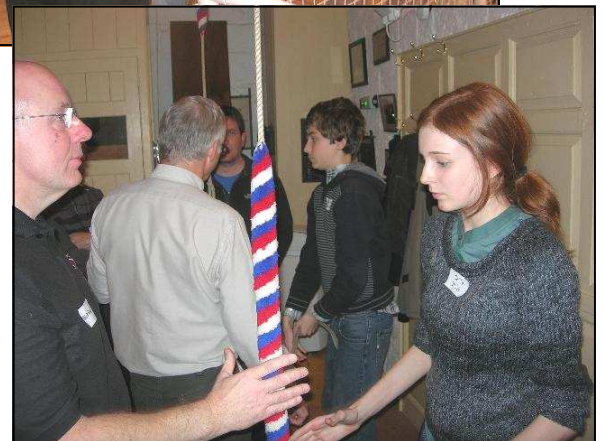
Putting the skills into practice at Olney