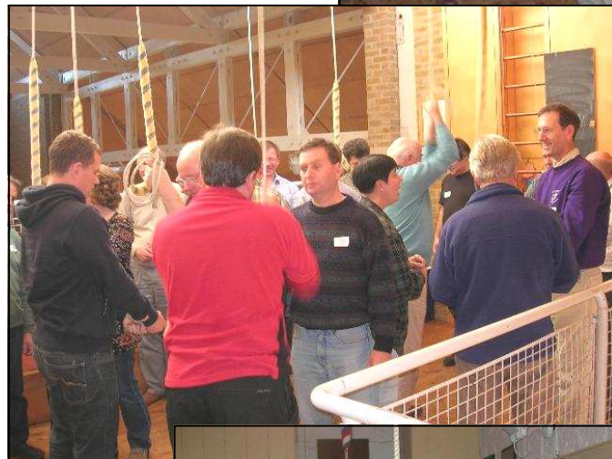
Photos from day 1 at Downs Barn